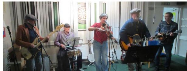
Back *Scarr Band