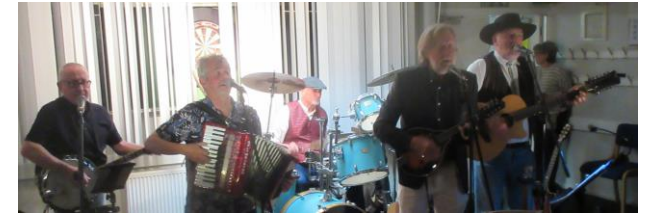
The Replacement Hipsters