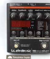
TC Delay Nova £150

For further information or to add your own