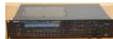
Roland JV 1080 synth module £150