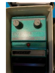
DOD envelope pedal £70