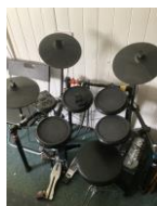
Alesis electronic kit £75