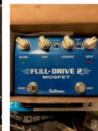
Full Drive £90