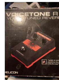
Voicetone Reverb as new £145