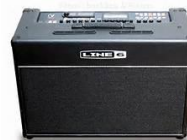
Line 6 Vetta 11 over £500 accept offers around £300