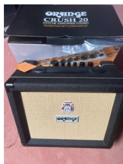
Orange Crush Amp as new £85