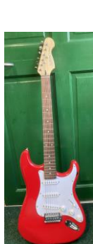
Crafter Cruiser Strat £55