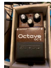
Boss Octave OC2 £150