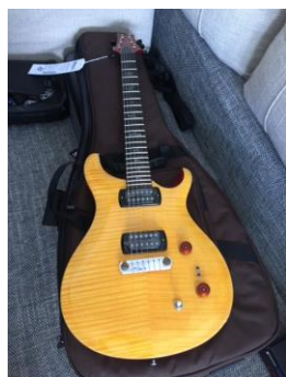
PRS guitar as new £650