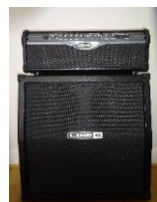
Line 6 Spider11 HD Head and 4 x12 cabinet and FBV2 footswitch Very good condition. Works perfectly as new offers around £200