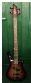
2 preowned Stagg Bass Guitars £75 each