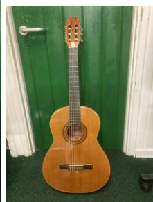
Classical Guitar Admira Hand Made