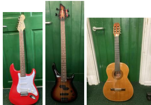
Crafter Cruiser Strat £55