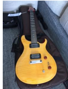
PRS guitar as new £650