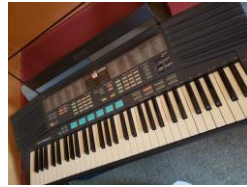
Yamaha PSR48 with case £50