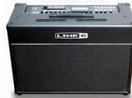
Line 6 Vetta 11 over £500 accept offers around £300