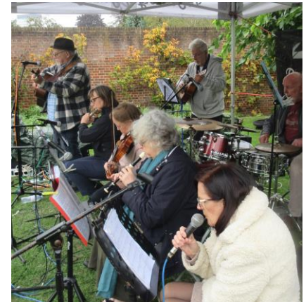
St Barnabas Band