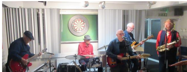
The Leyton Stones