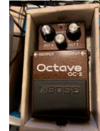
Boss Octave OC2 £150