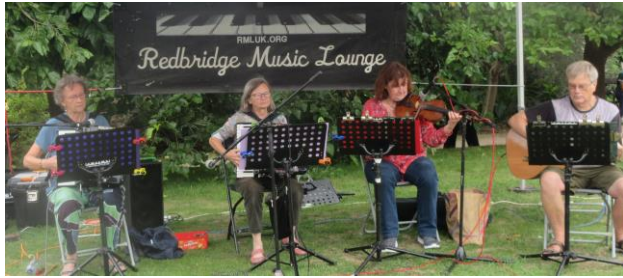
Storm in a Teacup