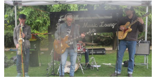
Pipeline Blue Band