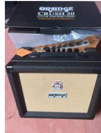
Orange Crush Amp as new £85