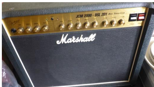
Marshall JCM2000 DSL dual super lead combo £275

www.rmluk.org The Redbridge Music Lounge BARGAIN BASEMENT for used instruments & equipment