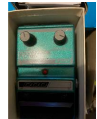
DOD envelope pedal £70