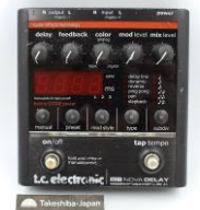
Voicetone Reverb as new £145 Full Drive £90 TC Delay Nova £150