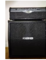
Line 6 Spider11 HD Head and 4 x12 cabinet and FBV2 footswitch Very good condition. Works perfectly as new offers around £200