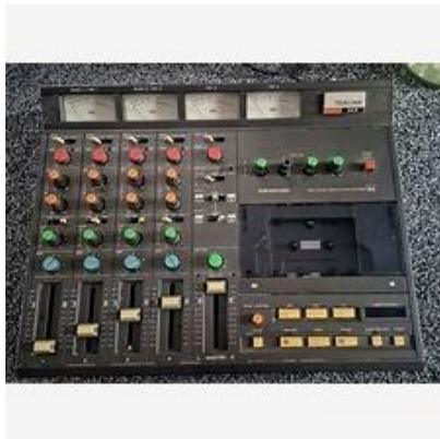
Tascam Portastudio vintage cassette £150