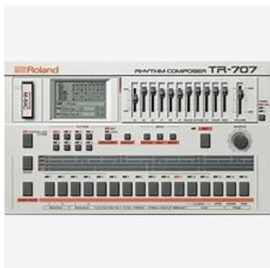
vintage & rare Roland TR707 Drum machine £500