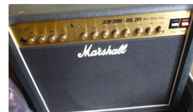
Marshall JCM2000 DSL dual super lead combo £275