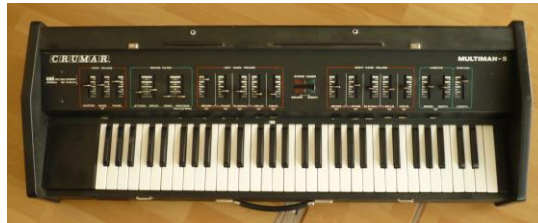
Rare and vintage Crumar Maultiman S keyboard worth £500-600 (offers)

www.rmluk.org The Redbridge Music Lounge BARGAIN BASEMENT for used instruments & equipment