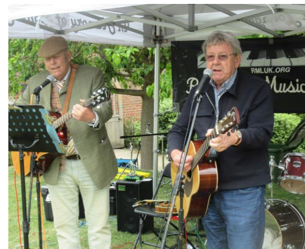
The Elderly Brothers