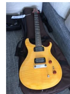
PRS as new &650