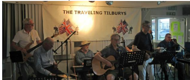
The Traveling Tilburys